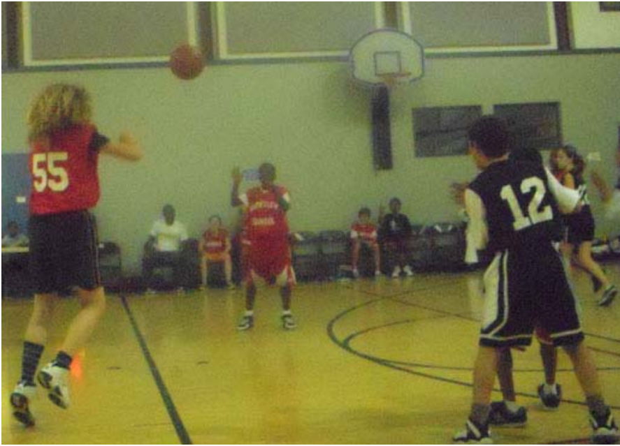
Above: The TBS Express eludes the defense in their recent basketball game against Archway. Below: "Rock and Roll Heaven:" The TBS staff holiday party featured performances by many of our talented musicians. As always, Your Newsnotes Staff is willing to spill secrets from the party if the price is right.