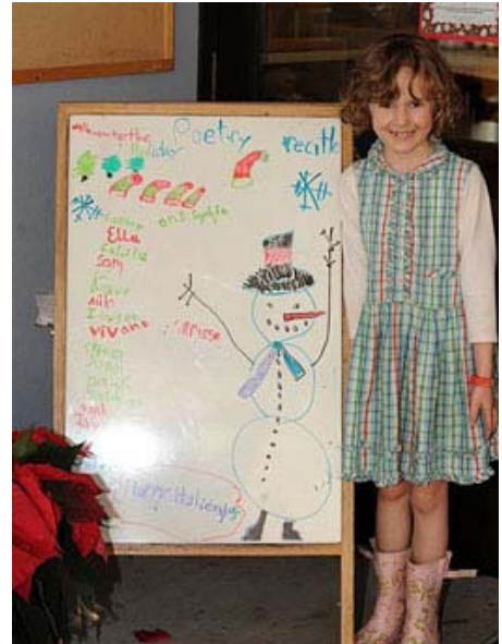
Above and below: Sweet Briar Creek held their annual poetry recitation on Thursday, December 17.