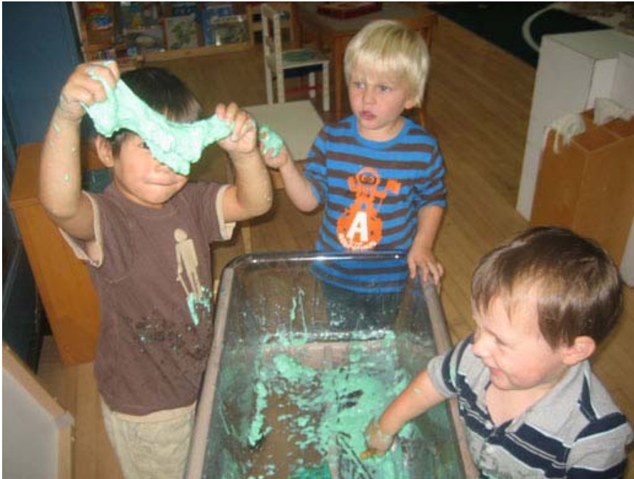
Above: Slimy fun in Eugenia! Below: Robotics, ECC style.