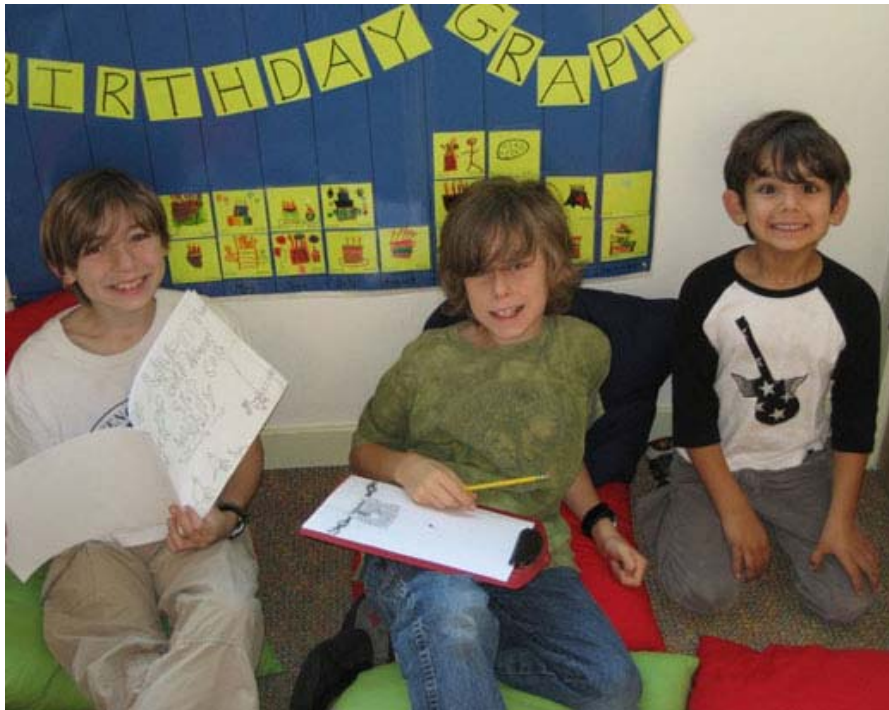
Above and below: Buddy classrooms Laurel (K-1) and Strawberry (4-5) work on the books they are writing and illustrating.