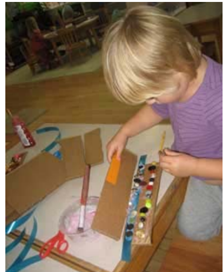
Above: A found art project in Eugenia. Below: Painting a winter watercolor in Cedar.