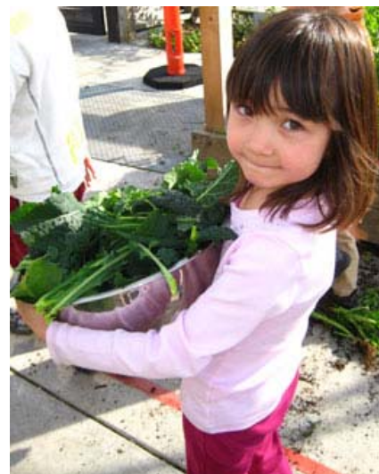
Above: Seed to table with Blackberry Creek. Below: Cerrito Creek students searched through their worm bin to determine how healthy their worm population is and to discuss ways to compost wisely.