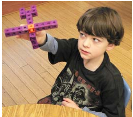
Above and below: Star Wars Day in Laurel Creek incorporated math, art, archetypes of good and evil, and wicked good models.