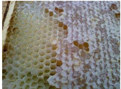
Above: A honeycomb made by the TBS bees glistens enticingly.