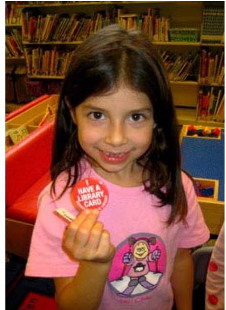
Above: Blackberry Creek visited the local public library this week!

"When schools ask for money beyond tuition, they're asking stakeholders to ensure that the best-trained, most committed adults are available to help students become everything they