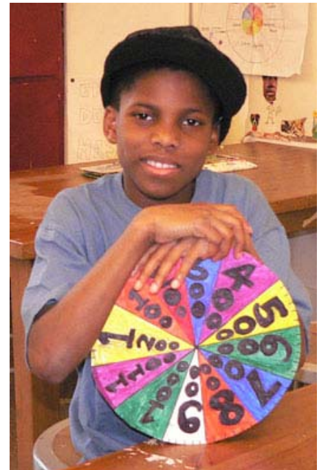
Above and below: Wildcat students have a lot to say about time on the faces of the clocks they created in art class!