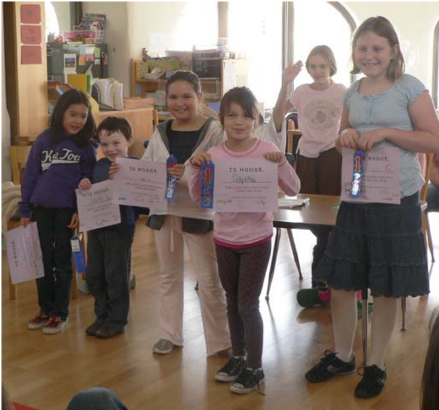
Above: The talented winners of the Library Club's story competition!