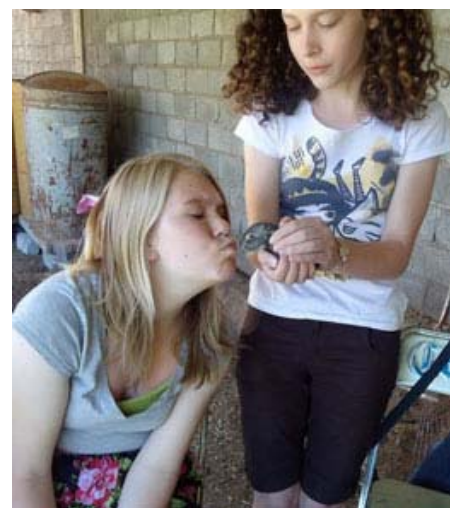
Above: Baby bunnies stole the show during an animal care workshop in El Molino. Below: Navigating the willow maze at the ECC.