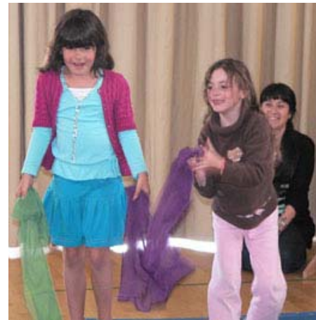
Above and below: two scenes from K-1's "Talent Time" on Tuesday!