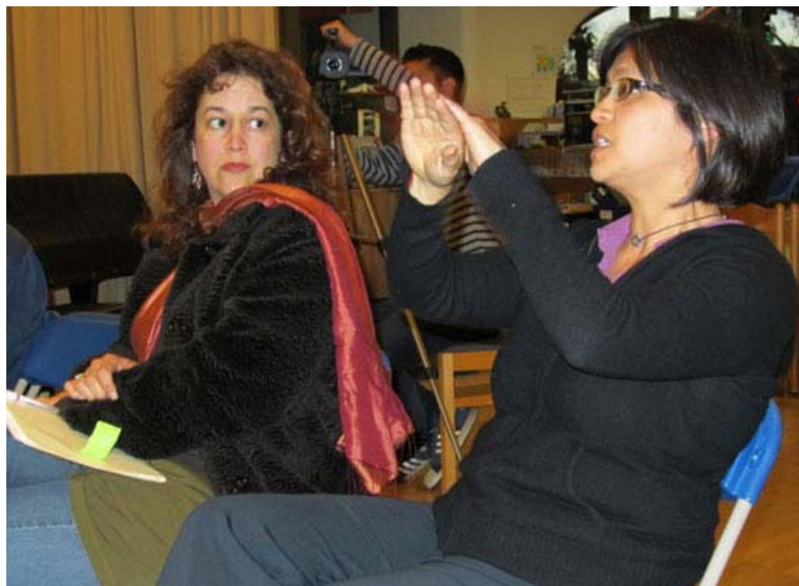
Above: A lively discussion during the accreditation parent ed. event Tuesday night. Below: Watercolor work at the ECC.