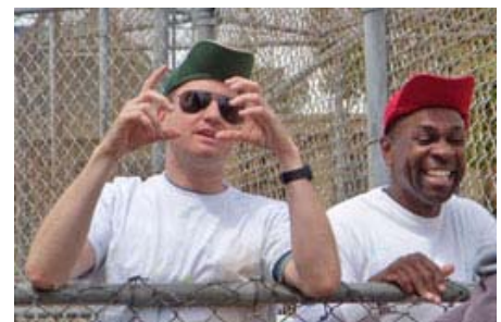
Above: The staff softball team's rally, featuring their stylish and becoming rally caps, fell just short. Below: Dust-up in the infield!