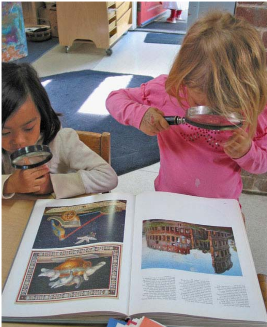
Above and below: ECC students first studied mosaics, then created their own in art class.

Temescal Creek and Sweet Briar Creek will hold their annual Beach Day on Friday, June 4. The students and their teachers will visit beautiful Heart's Desire Beach in Tomales Bay. Complete information will be coming from your child's classroom. Pray for good weather!