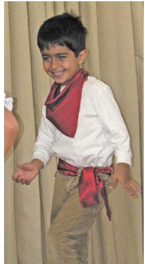
Above and below: More scenes from Laurel Creek's Mexican-Peruvian dance performance.