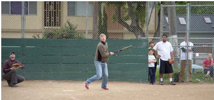
Above: Can you say, "Pop fly?" Below: The teams confer just before the start of the marathon game.