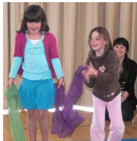
Above and below: two scenes from K-1's "Talent Time" on Tuesday!