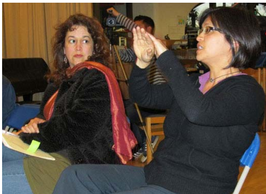
Above: A lively discussion during the accreditation parent ed. event Tuesday night. Below: Watercolor work at the ECC.