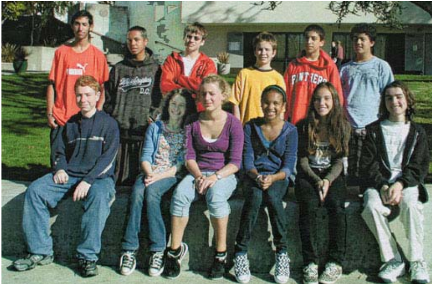
Above: Members of the eighth grade class visit St. Mary's College High School for a look at one possible future. Below: Members of the TBS class of 2009 visit their old stomping grounds for the Ice Cream Social. The high schools attended by these students include Lick-Wilmerding, Berkeley High School, Maybeck High School, and The Urban School of San Francisco.