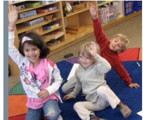
Above: eager beavers in Blackberry Creek vie to answer a question. Below: A Blackberry student shows her "Quick Shape."