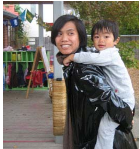
Above: A new student arrives for his first day at the ECC. Below: The concentration is intense as an ECC student works on her handwriting skills.