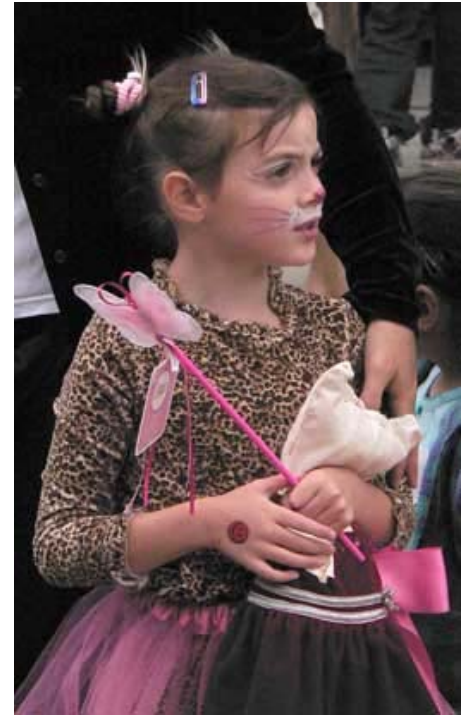
Above: Even princesses and kittens -- and kitten princesses -- waited patiently in line for their treats at the Ice Cream Social on Sunday, October 18.